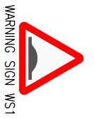
WARNING SIGN WS1