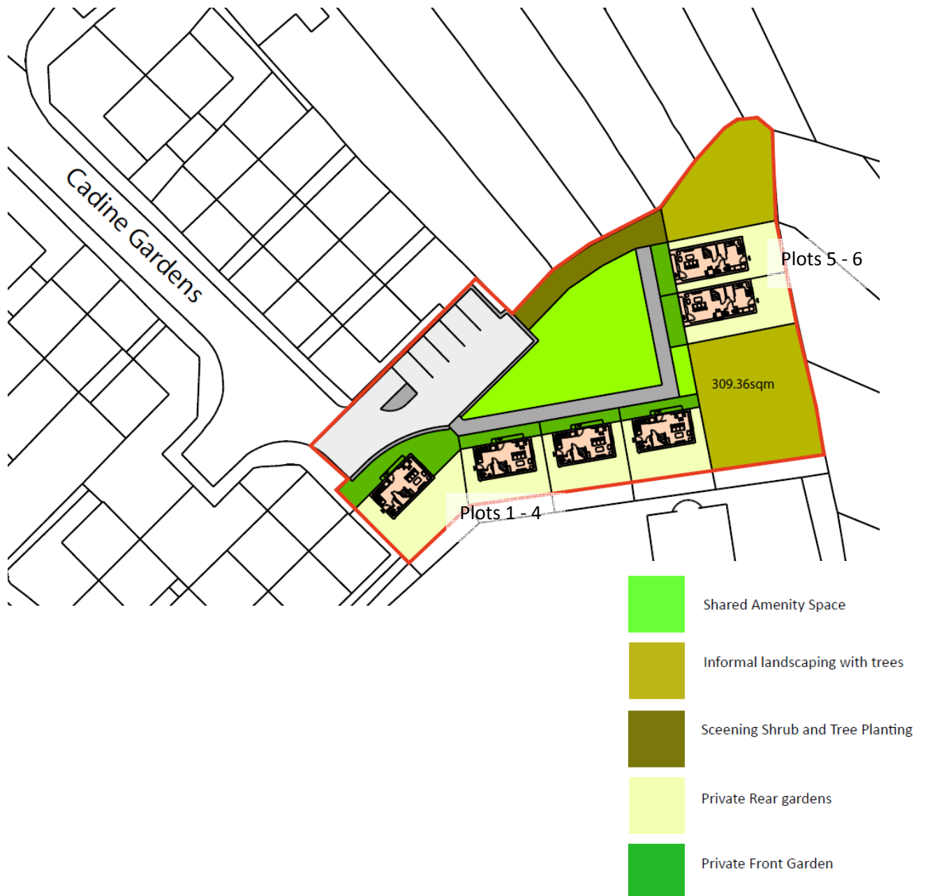
Figure 2: Proposed Site Plan.

Next to a small area of neighbouring rear garden boundaries there will be a landscaped buffer of shrubs and trees. In the rear north east of the site there will be a small area of informal landscaping with trees that will be fenced off with access for maintenance. In the south east of the site there is a small area of land with potential use for the community.