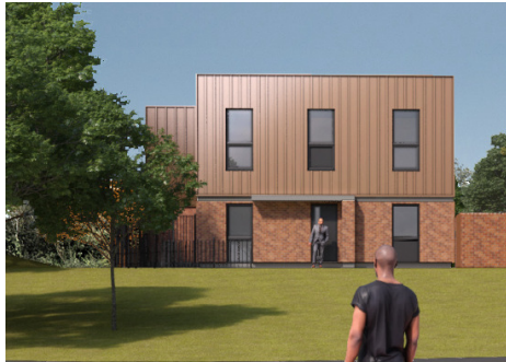
Plots 1 - 4