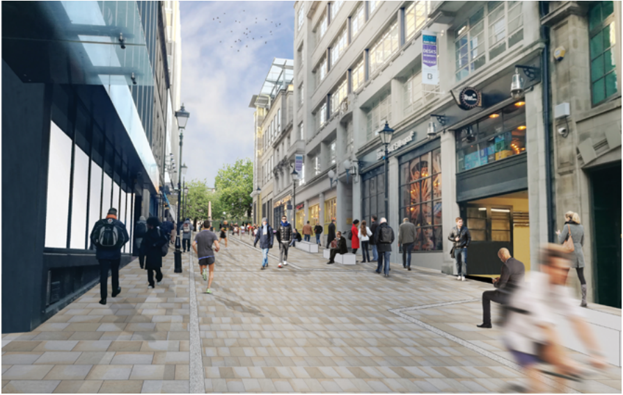
Proposed view of Temple Street looking north towards Cathedral Square