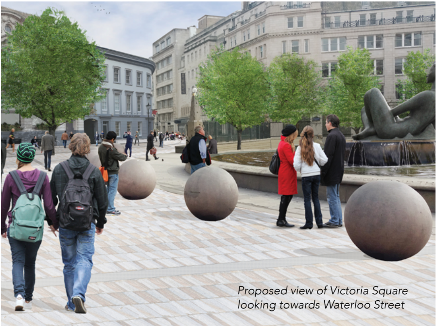
Proposed view of Victoria Square looking towards Waterloo Street

Birmingham City Council, alongside Central and Colmore Business Improvement Districts (BIDs), are consulting on plans to enhance public spaces and connectivity in the city centre to create an attractive, welcoming and safer environment to attract more visitors to Birmingham city centre which will assist economic growth.