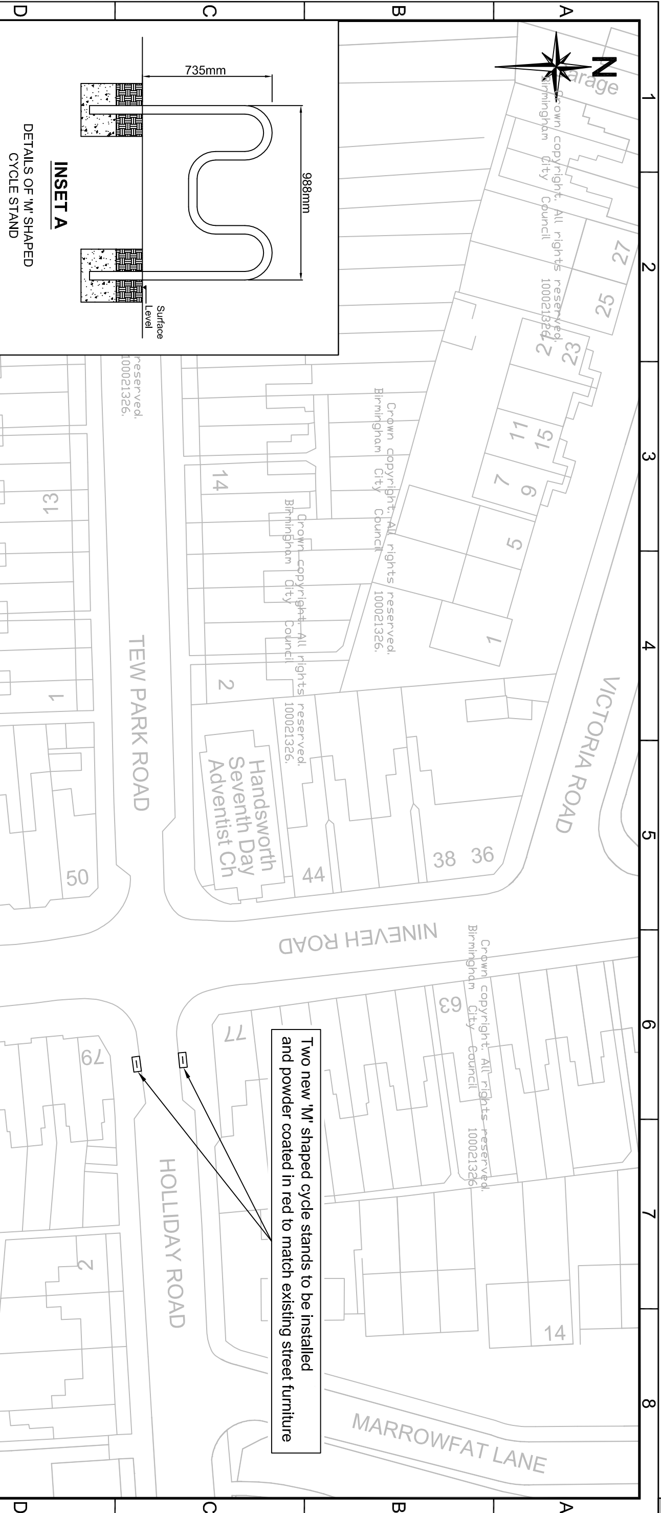
INSET A DETAILS OF 'M' SHAPED CYCLE STAND