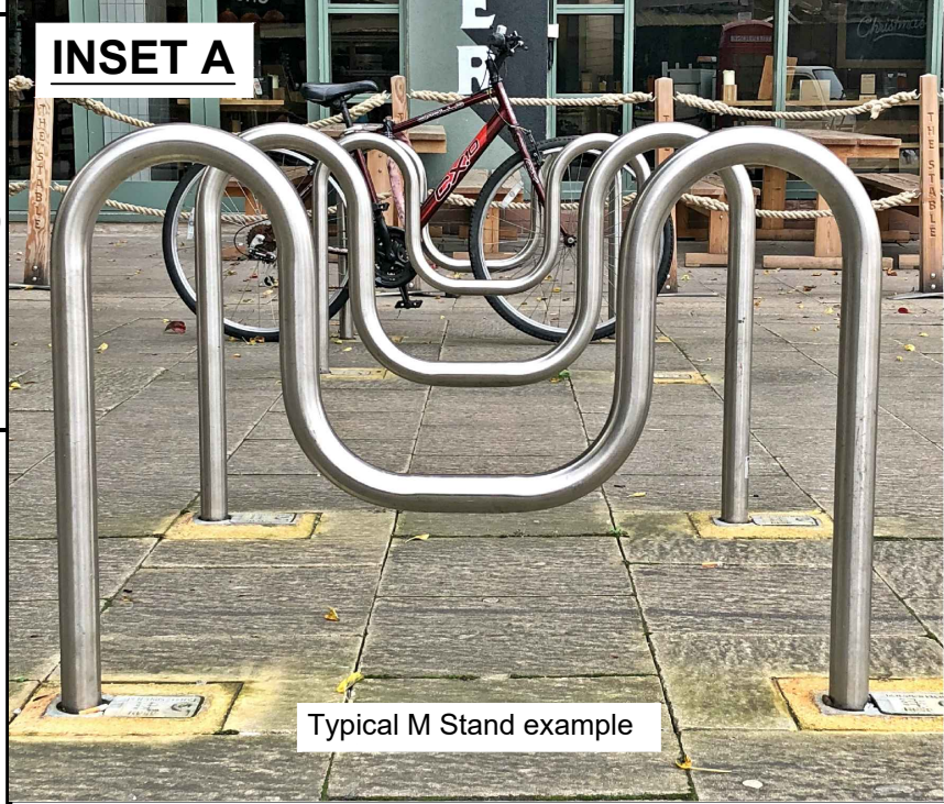
Typical M Stand example