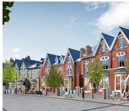
Indicative visual of the new-look Greenfield Crescent