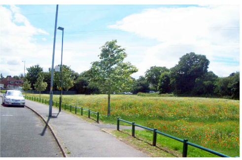
View after proposal on the corner of Parkdale Drive looking South West showing new mixed wild flower meadow and semi mature tree planting.

View before proposal on Cofton Road near Longbridge Lane looking North East.