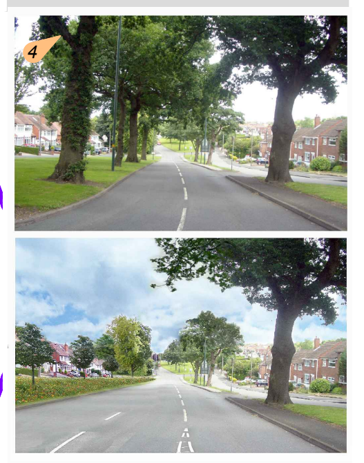
View after proposal on Cofton Road looking North East showing new road layout, new mixed wild flower meadow and new tree planting.

View before proposal on Cofton Road near Longbridge Lane looking North East.