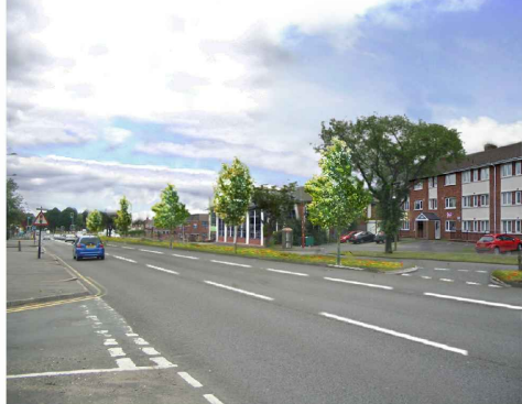
View after proposal looking East showing new mixed wild flower meadow and tree planting.

View before proposal on Bristol Road South near Belton Grove looking East