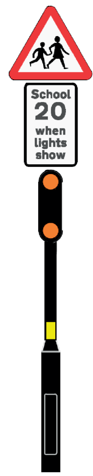
INSET A Proposed variable 20mph speed sign (NTS)