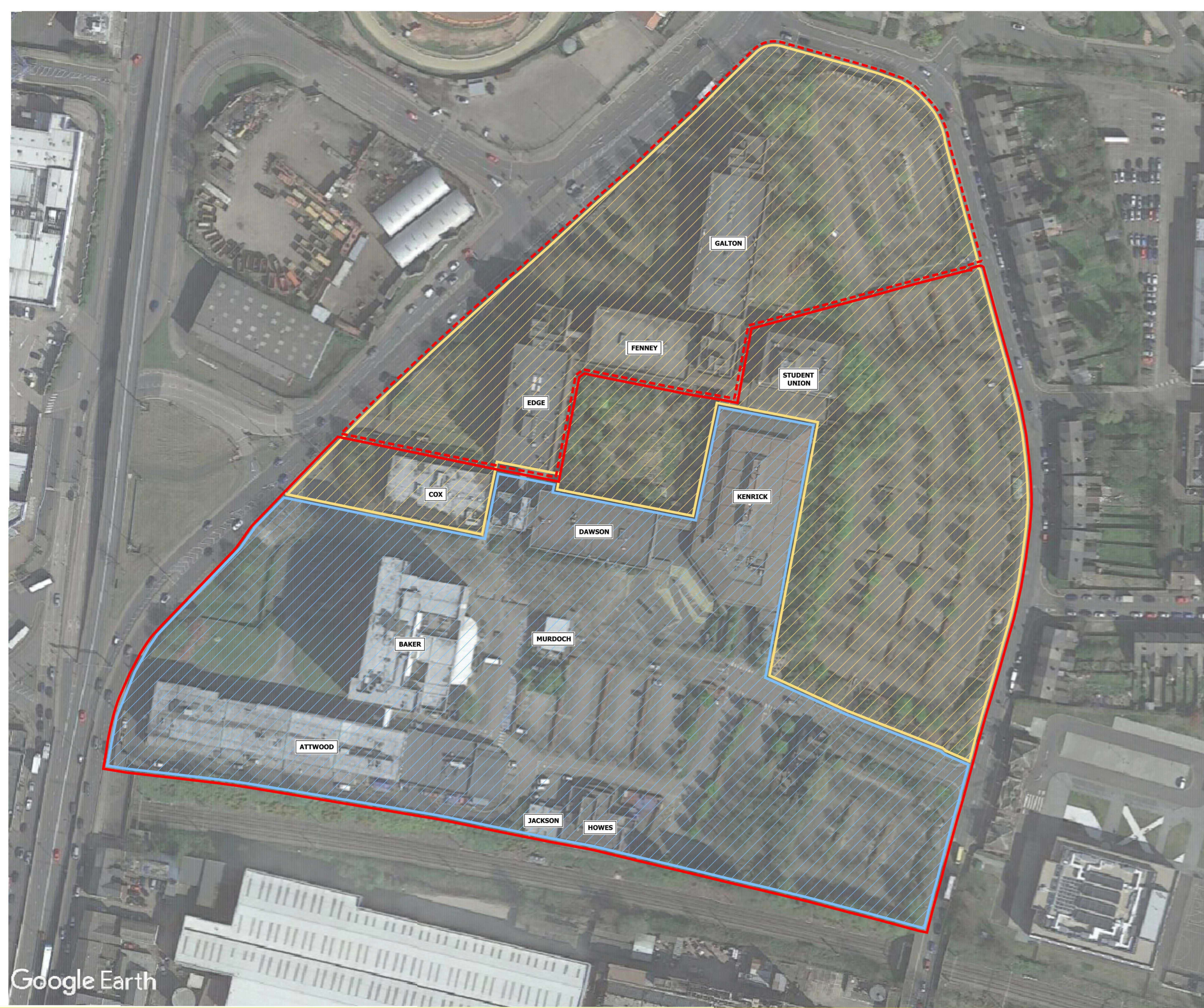
Demolition and Remediation Phasing Plan