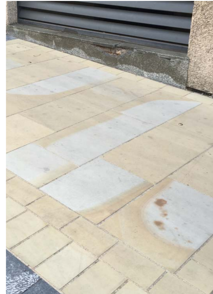
Image: Yorkstone, Church Street