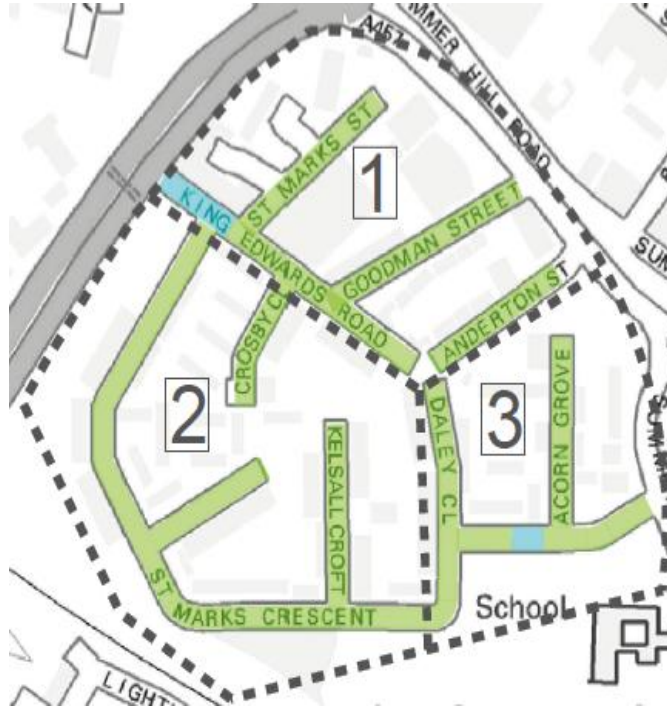
Map data © Crown Copyright. All Rights Reserved. BCC License Number 100021326. 2015