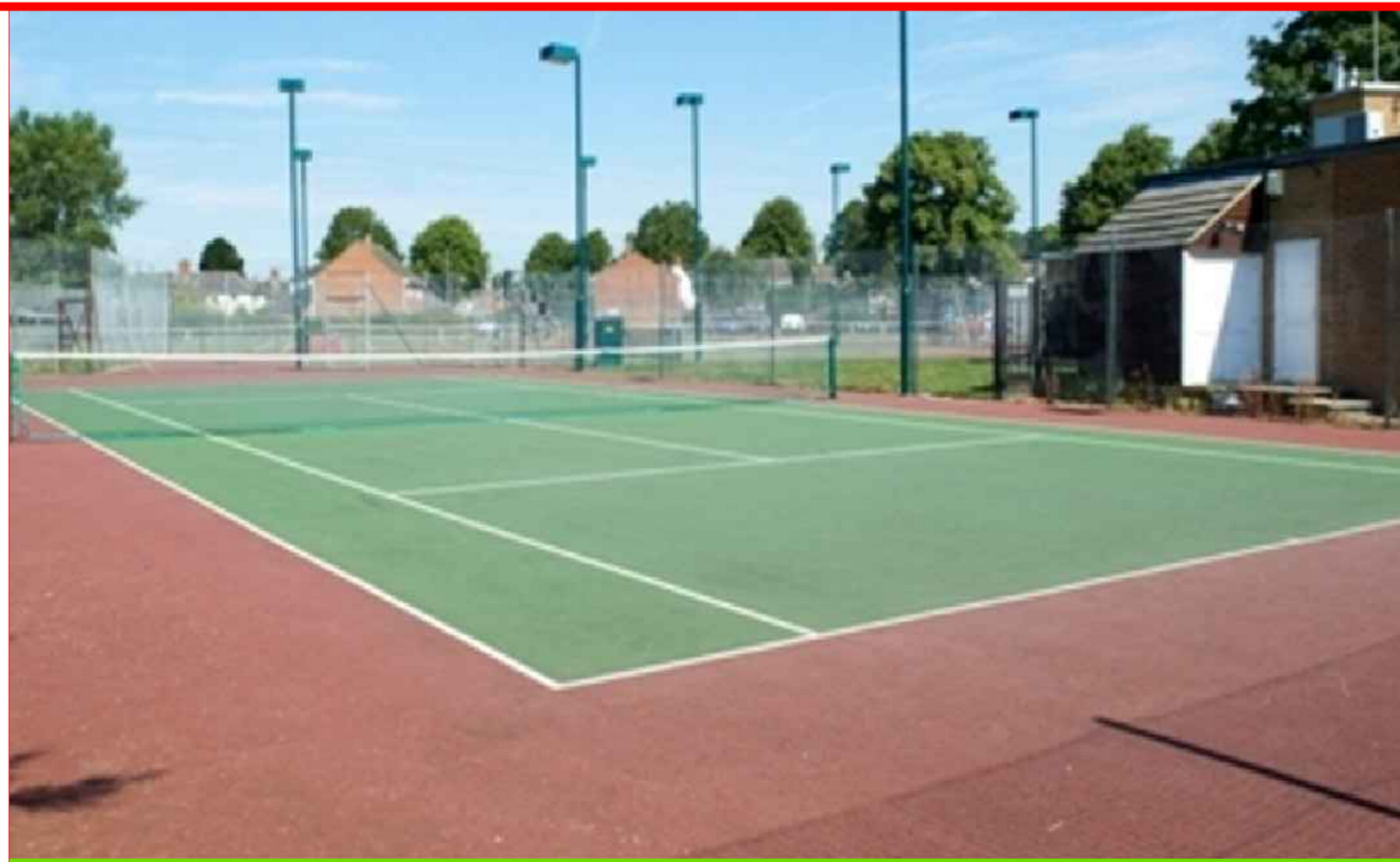
BALL GAMES, TENNIS COURTS Enclosed, artificial surface