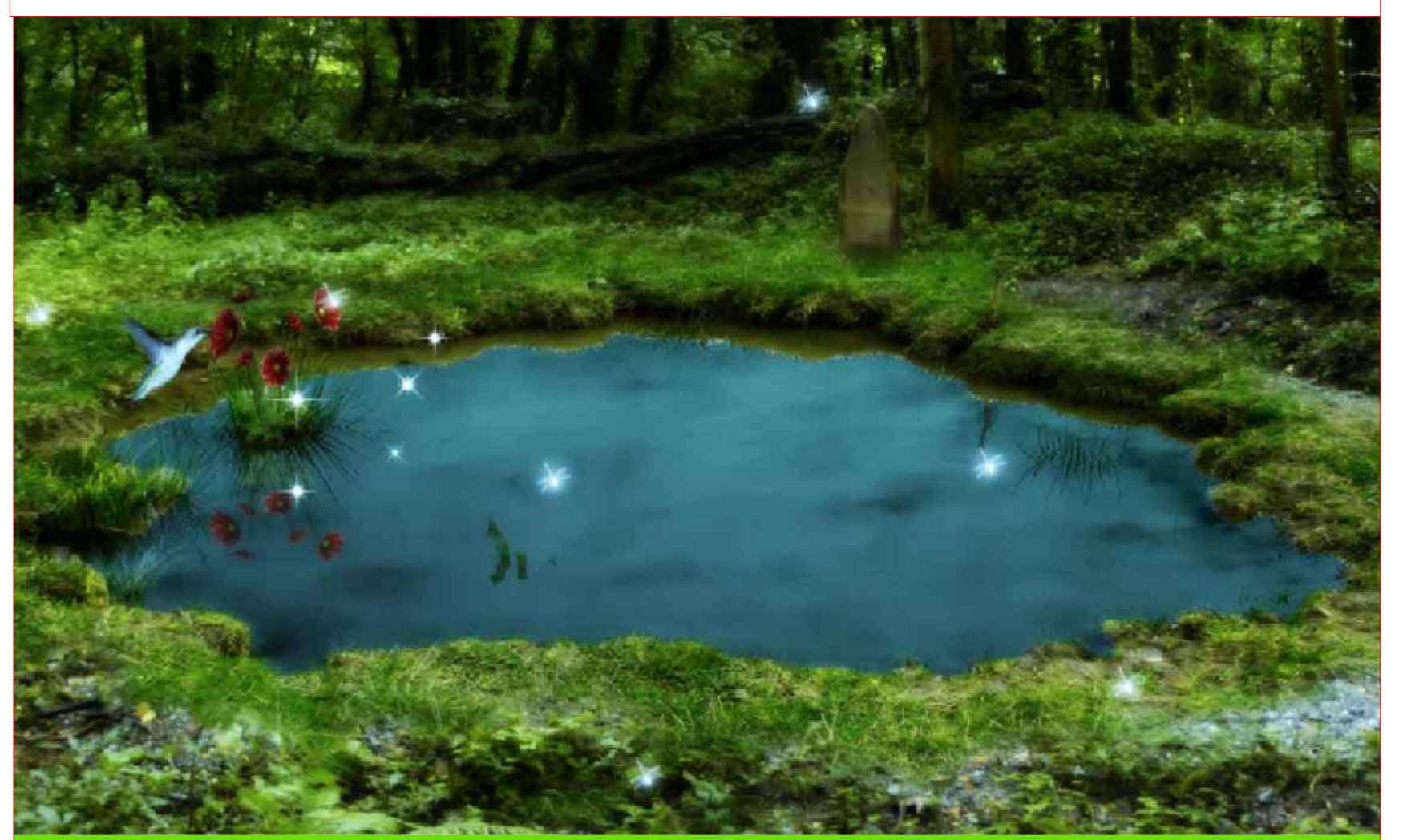
WILDLIFE DIVERSITY, COPSE, THICKET, MARGINAL, WETLAND