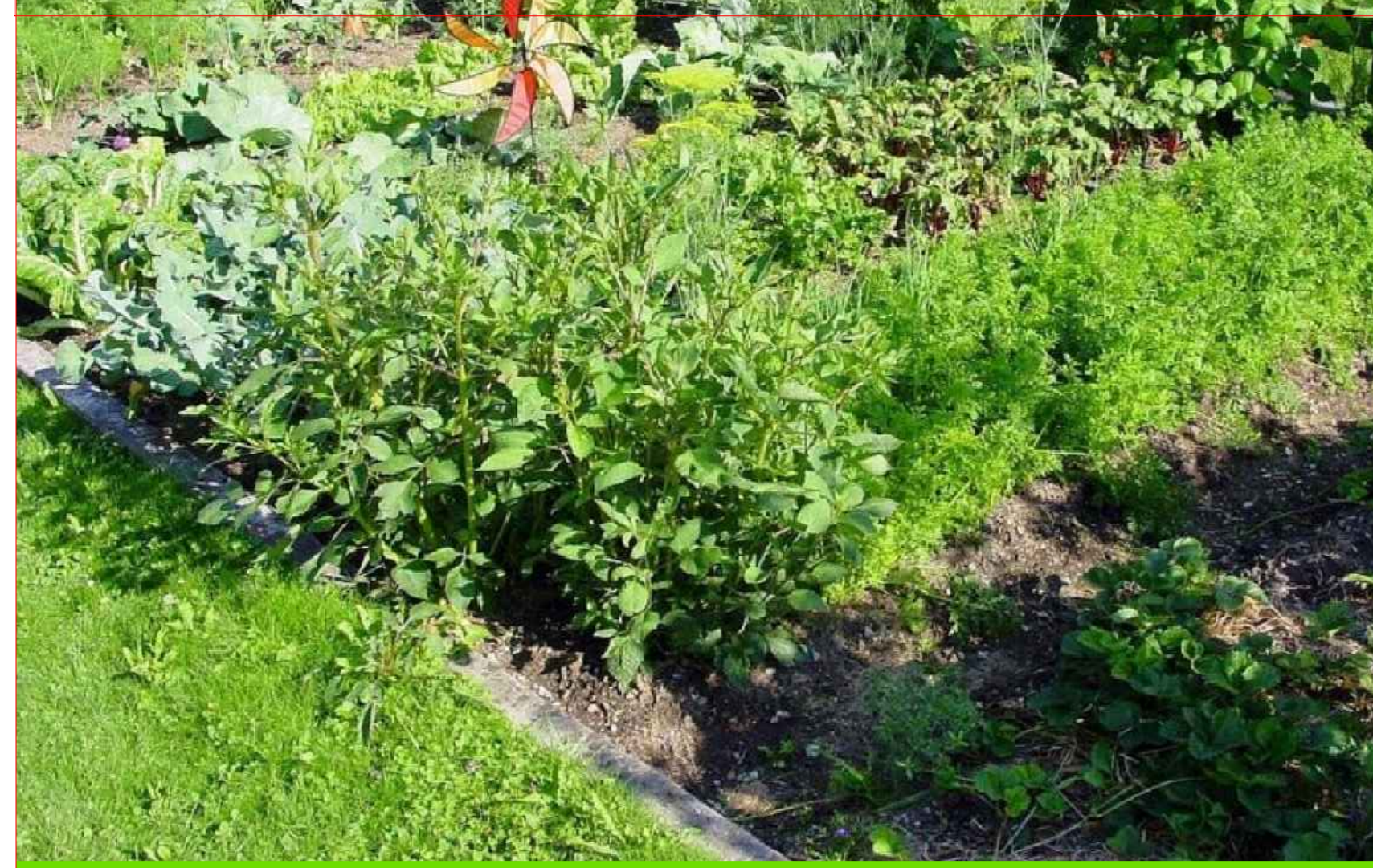
HORTICULTURAL PLOTS, GROW YOUR OWN FACILITIES. Educational / Community shared resource