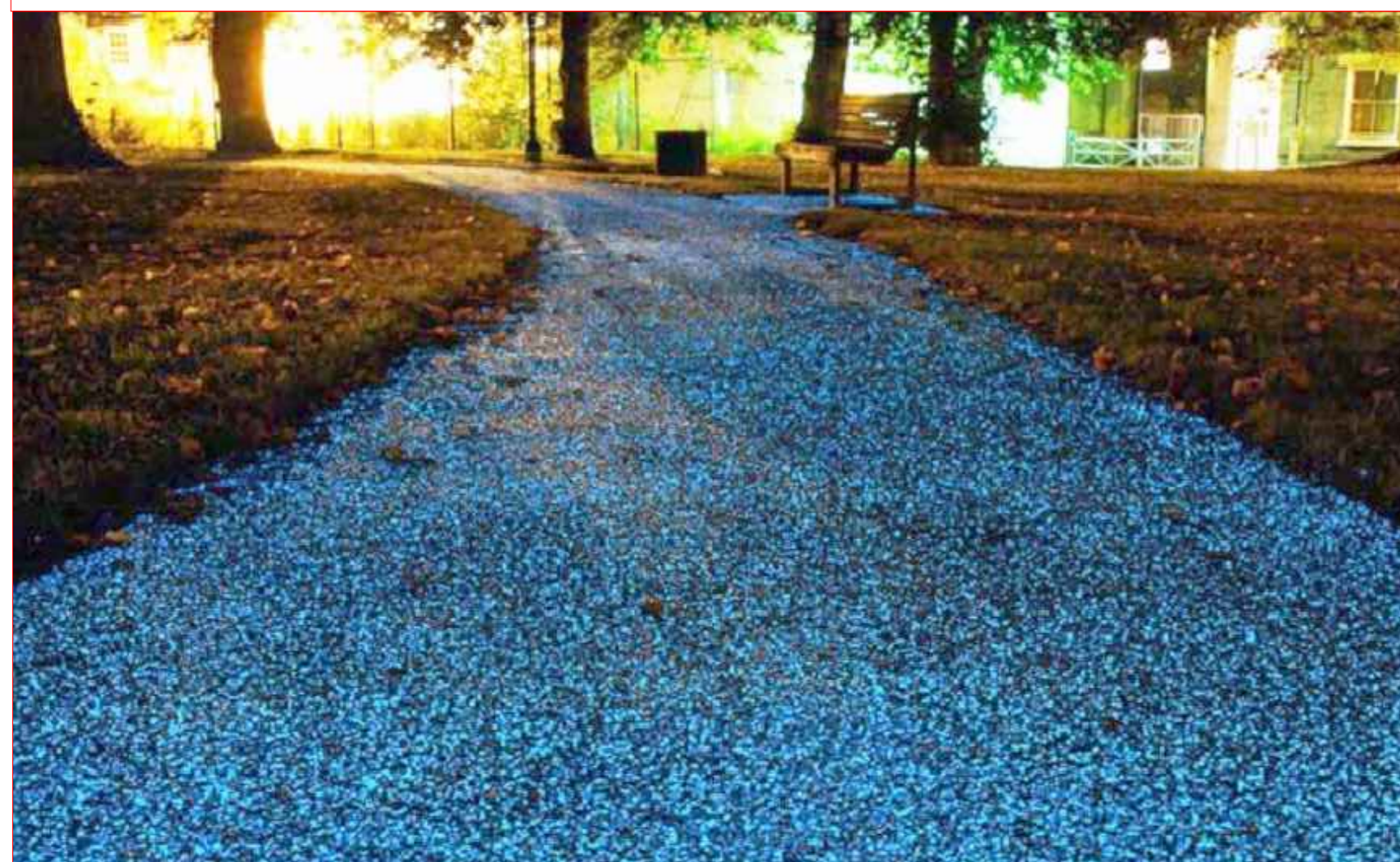
CENTRAL PROMENADE: KEEP FIT "Solar Glow" Shared porous multi use surface facility