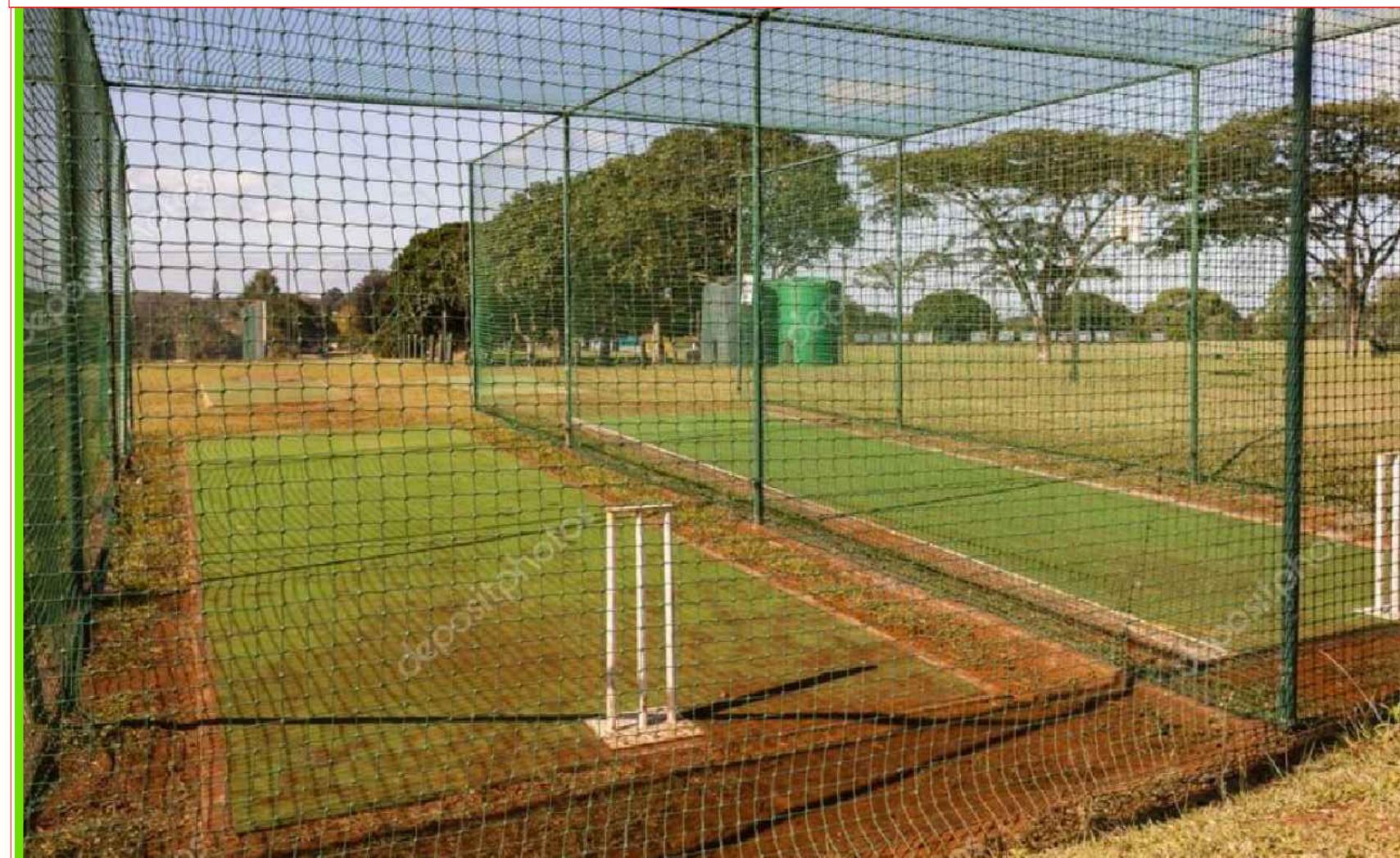
ENCLOSED CRICKET SPORTS PRACTICE All Year Round. Artificial surface.