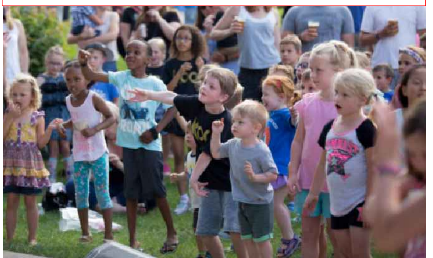
COMMUNITY EVENTS, CELEBRATION, NEIGHBORHOOD FOCUS