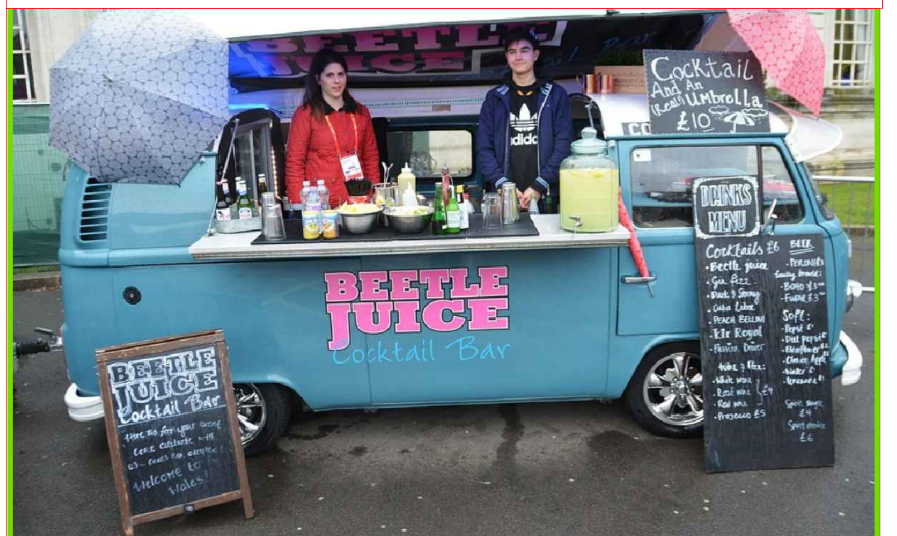
OCCASIONAL MEETING, 'POP UP' RETAIL FACILITIES