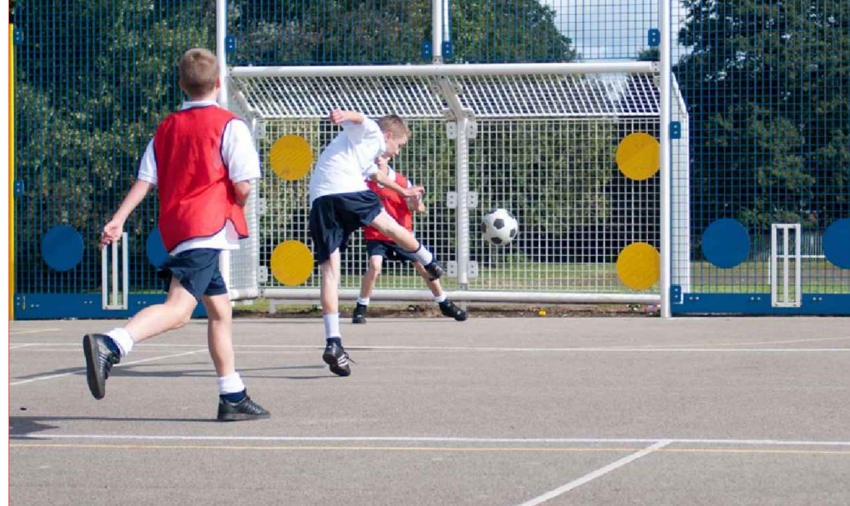
MULTI USE GAMES COURTS All weather porous surfaces