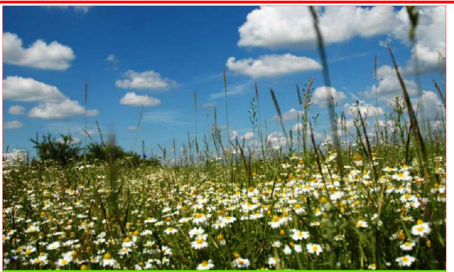
HABITAT CREATION, BULBS, WILD FLOWER MEADOWS