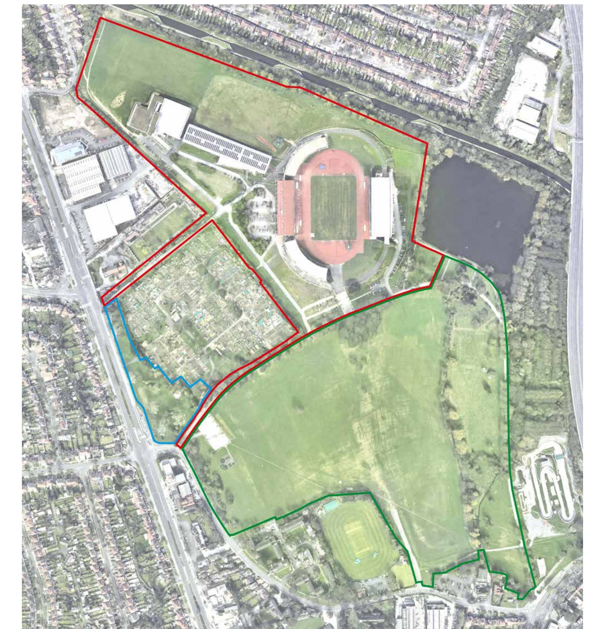
Site boundary outline (red: detailed application site, green: outline application site, blue: Birmingham City Council land)