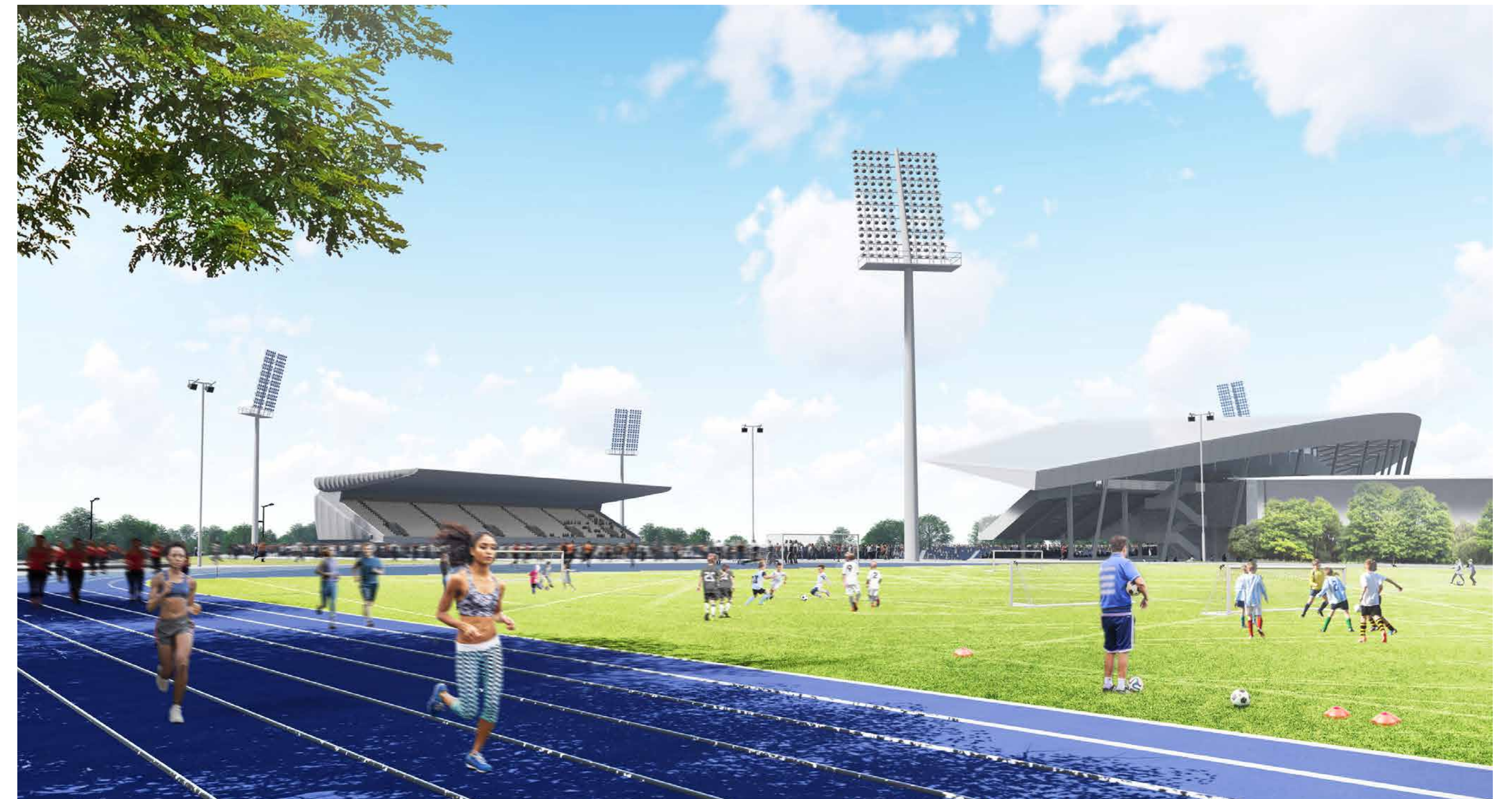
Artist impression: view from the warm up track

Demolition of the current west stand within the stadium is subject to a separate application which will be submitted to Birmingham City Council in Summer 2019.