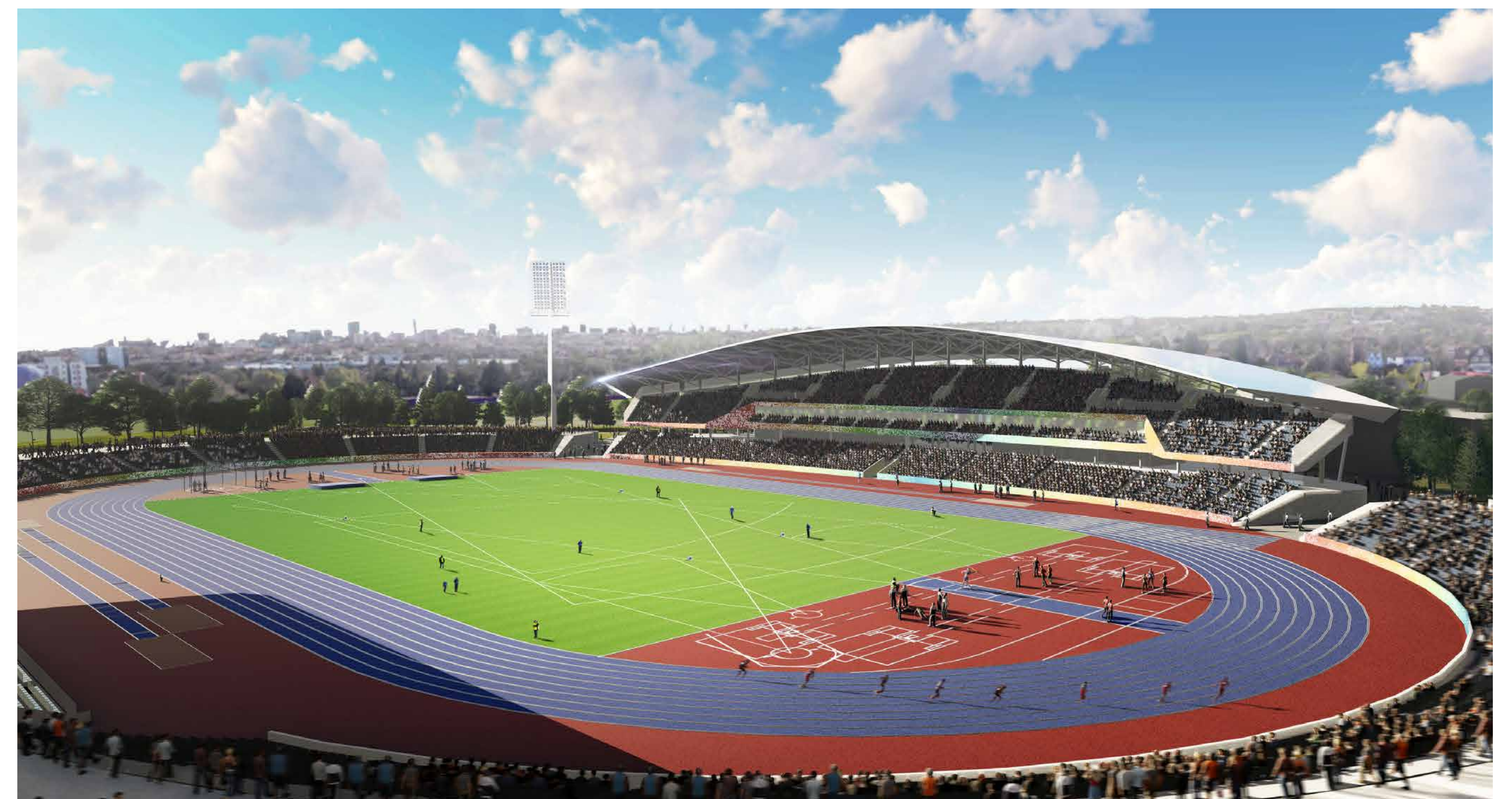
Artist impression: view from the north east corner of Alexander Stadium