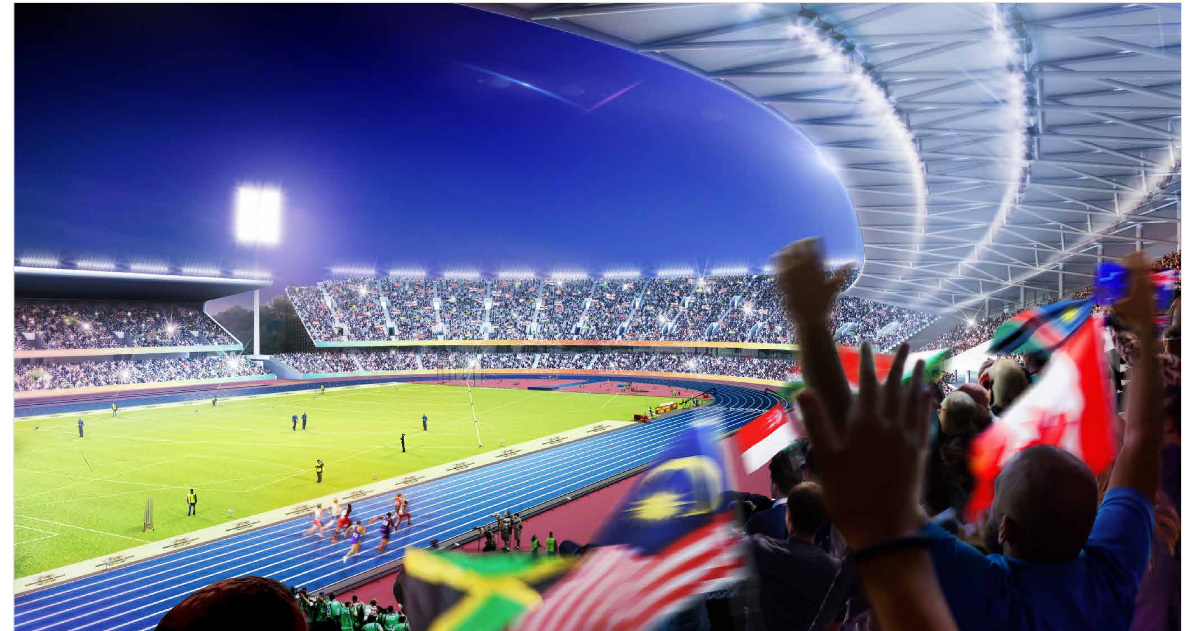
Artist impression: During the Games, inside the new West stand

An enhanced and refurbished Alexander Stadium is pivotal to the delivery of both the athletics programme and opening and closing ceremonies. The revamped stadium will be able to host up to 40,000 spectators during the Games. Post-Games, temporary seating will be removed but there will remain a permanent capacity greater than at present and enhanced community facilities.