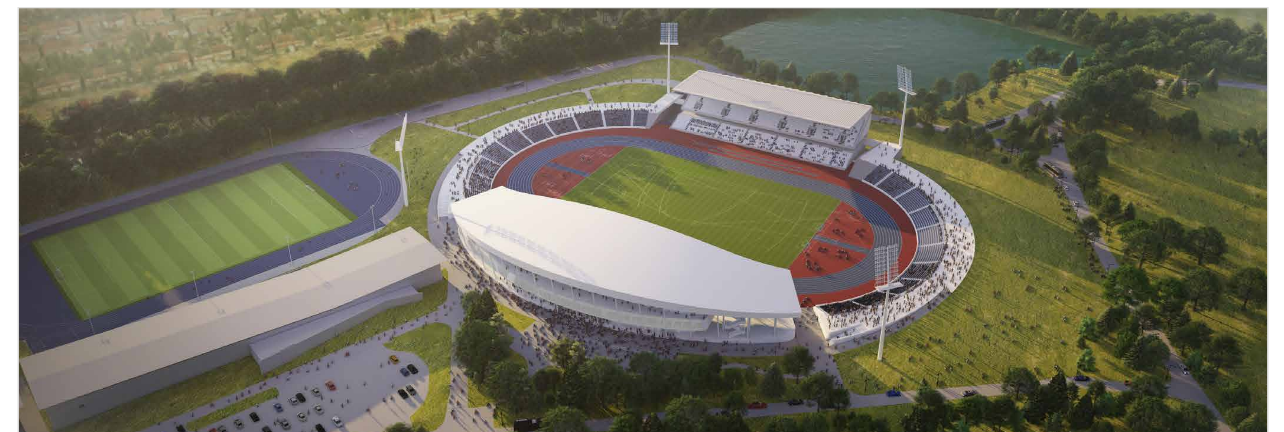
Artist impression: aerial view of the redeveloped stadium and warm up track