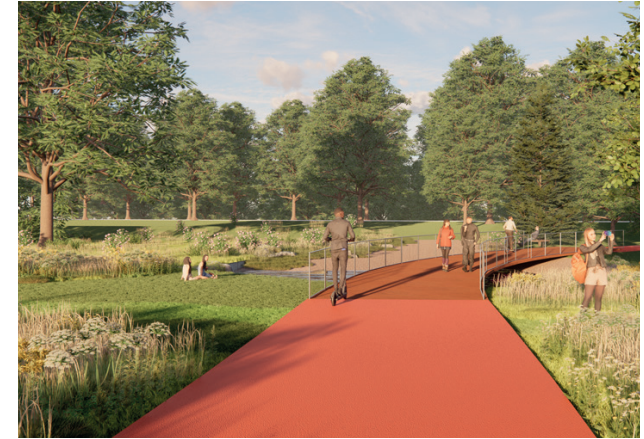
Artist's impression of the new bridge across the stream and surrounding planting