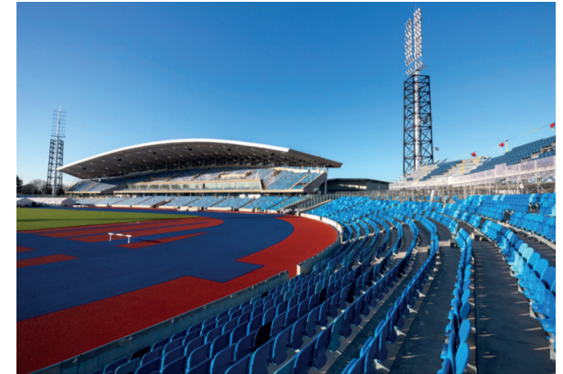
Redeveloped Alexander Stadium