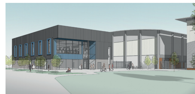
Artist's impression of the proposed GMAC extension