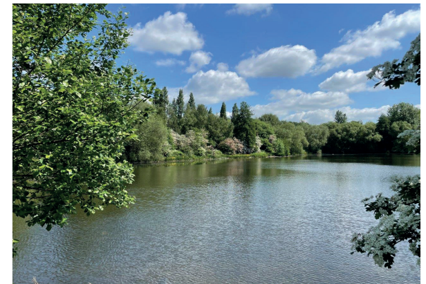
Perry Reservoir viewed from the East Stand