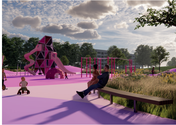
Artist's impression of the play facility