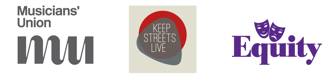
This is version 0.96 of the guide, produced in May 2016.