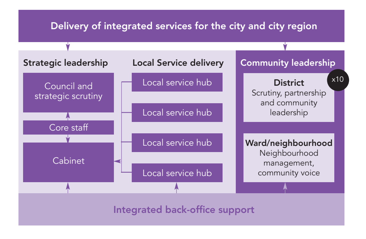
Diagram showing the overall framework for change