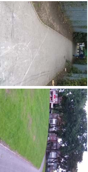
An alley to Oakhurst Road, showing motorcycle damage to tarmac

There are a variety of entrances to secure, from very small alleyways to wide road fronts. These would all be treated with the same style fences and gates, in order to create a cohesive character throughout the site.