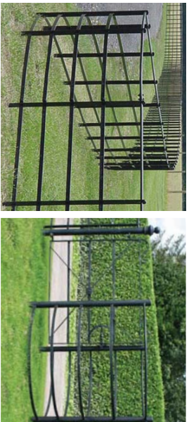
Above: Classic metal estate railings and a matching Kissing Gate

Improve security by installing railings and barriers. These may be either a metal estate railing, or a timber and metal railing. There would be access via chicanes, kissing gates or anti-motorcycle gates.