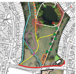
Possible 'Southern' path

A new path could be created, leading from the lower East corner and towards the fishing pond. This follows an existing Desire Line worn into the turf. This would also include a new footbridge across the brook. This should streamline access to the park from this corner, reducing congestion on the main path to the north. Another path running across the top of the park could help to decomgest the main path running north to south, and create an effective park "circuit", connecting all access areas smoothly.