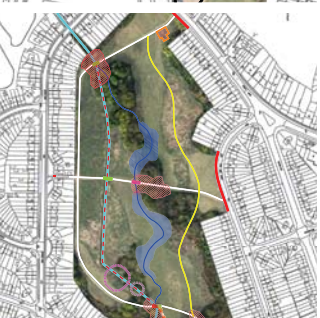
Possible 'Western' path