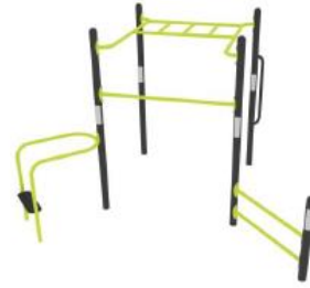
Multi Purpose Fitness Frame

3.Tree trail enhancements: Further development of the meadow which slopes down from the trees towards the cricket pitch at the North end of the park – planting of wild flowers and additional trees. This would be a quick win and is relatively cheap to deliver, estimated at £15,000 allowing for a maintenance contribution.