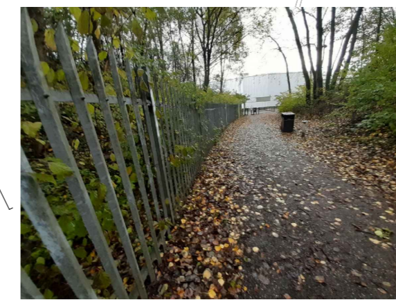
Remove the end panel from the existing palasade fence to allow access to the woodland