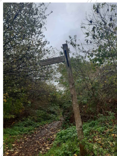
Existing finger post to be retained but two of the fingers to be replaced. Text 'Asda Way' will be replaced with 'Linnecor Way'