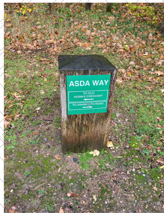
Existing waymarker to be retained but metal sign to be replaced. Text 'Asda Way' will be replaced with 'Linnecor Way'