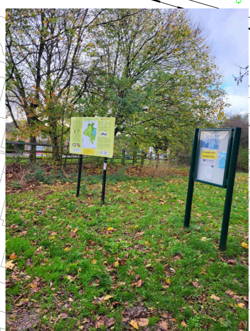
S2 - Replace existing signboard with updated information

NOTE: 5 new trees to be planted with memorial plaques in memory of late members of the Friends Group. Locations to be agreed with Friends Group and Park Ranger.