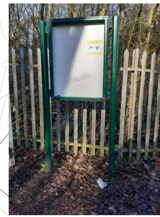
N1 - Replace glass in existing notice board