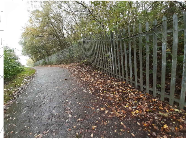
Existing palasade fence to be retained

Tree works to be carried out within this woodland for a better and safer access. Existing woodland to be re-named as 'Linnecor Woodland'