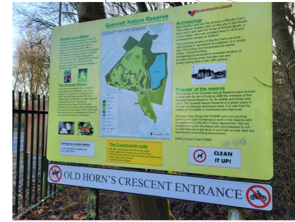
Replace existing entrance sign with updated information