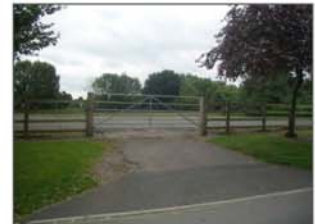
TEMPORARY CAR PARK & WINTER ANIMAL HOLD