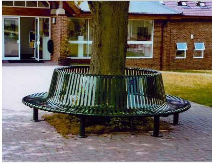
Curved Bench Example