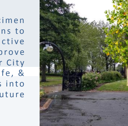
Additional specimen trees in key locations to strengthen distinctive character, improve views, and deliver City air quality, wildlife, & well being targets into the future